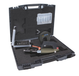
1 standard matrix kit for extraction and rivet positioning :