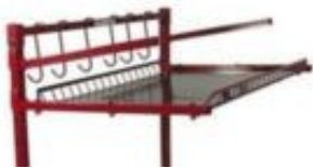
Innovative Shelf Mat