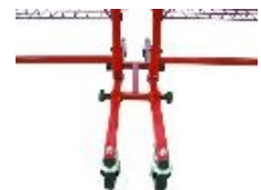
Innovative H Bracket