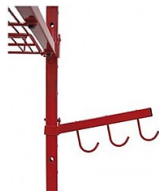
Innovative Hanger Bracket