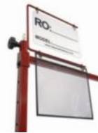
Innovative RO Holder