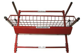
Innovative Parts Pan