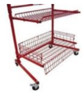
Innovative Deep Basket