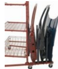
Innovative Panel Train