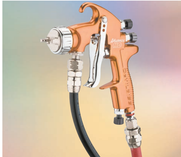
Advance HD compliant pressure feed spray gun with DeVilbiss quality hoses and connectors

The Advance HD spray gun's are specially designed to satisfy the highest quality volume finishing demanded in many Industrial Applications, spraying all types of surfaces including wood, metal, plastics, ceramics and composites. The Compliant Pressure feed spray gun provides unrivalled transfer efficiency, resulting in considerable material savings for the medium to high volume user. And, of course, Advance meets all existing and foreseeable environmental regulations.