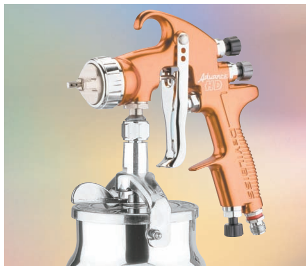
Advance HD compliant suction feed spray gun with KR-566-1-B 1 litre aluminium suction cup

DeVilbiss Advance HD has a very wide selection of fluid and air nozzles to provide outstanding atomisation over a wide range of materials including high solids, solvent/ water-borne paints, lacquers, stains, glaze, base and clear coats, twin pack and many other finishing materials.