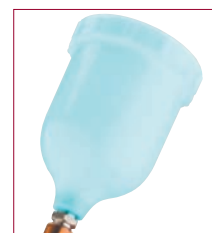
Gravity cup (Blue polyester) pt. no. GFC 511 for difficult fluids.