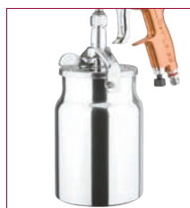
Suction cup pt. no. KR-566-1-B

Advance HD spray guns are packaged as:- pressure gun only, suction gun kit include 1 litre cup and Advance gravity feed kits inc. 568 ml standard gravity cup.