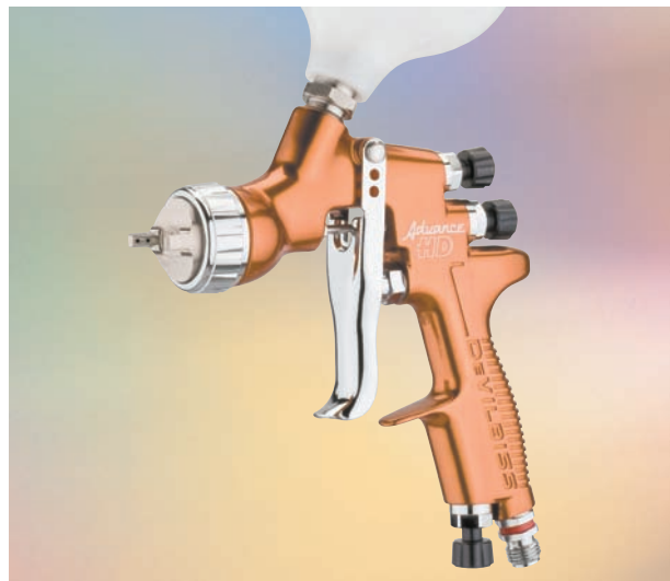
Advance HD compliant gravity feed spray gun with GFC 501 gravity cup (568cc.)

The Advance HD Gravity high performance gun will cover as fast as a conventional gun but with very high material savings. Advance HD compliant gravity feed gun is the profitable way to achieve superb standards of finish quality. Gravity feed guns are becoming increasingly popular because colour changes are quick and don't waste expensive paint. Thanks to its lightness, ease of handling and performance superiority DeVilbiss Advance Gravity sets the standard as the preferred gun for the industrial finishing marketplace.