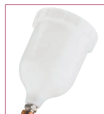
Gravity cup pt. no. GFC 501