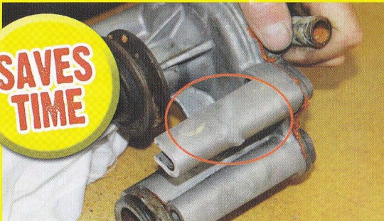
Water pump case broken