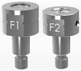
F1 + F2 Flow-Form Ø 6 mm rivets. Rivets : A1, A2, A3, S0, S1, S2, S3, S4, S5 and S6