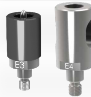
E3 + E4 Extraction de rivets Flow-Form Ø 6 mm.