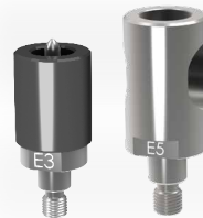
E3 + E5 Extraction of Ø 8 mm Flow-Form rivets.

WARNING ! This kit cannot be used with the HR1 arm. It must be used with the HR1S / HR2 / HR3 arms.