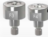
F3 + F4 Flow-Form Ø 8 mm rivets. Rivets : S28, S38, S48, S58, S68