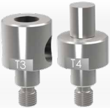
T3 + T4 Holes drilling Ø 8 mm.