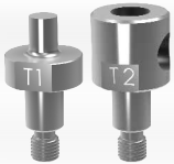
T1 + T2 Punching die Ø 6 mm.