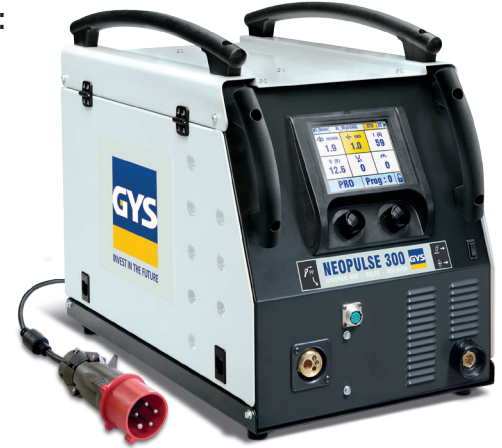
Product delivered without accessories.

The NEOPULSE determines optimum conditions of welding and enables to adjust them (feed wire speed, voltage, current, smoothing coil).