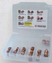
Form A-32 Item N° 497096