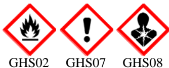
GHS02 GHS07 GHS08