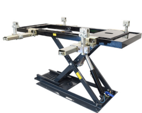
JOLLIIFT 1330 BENCH