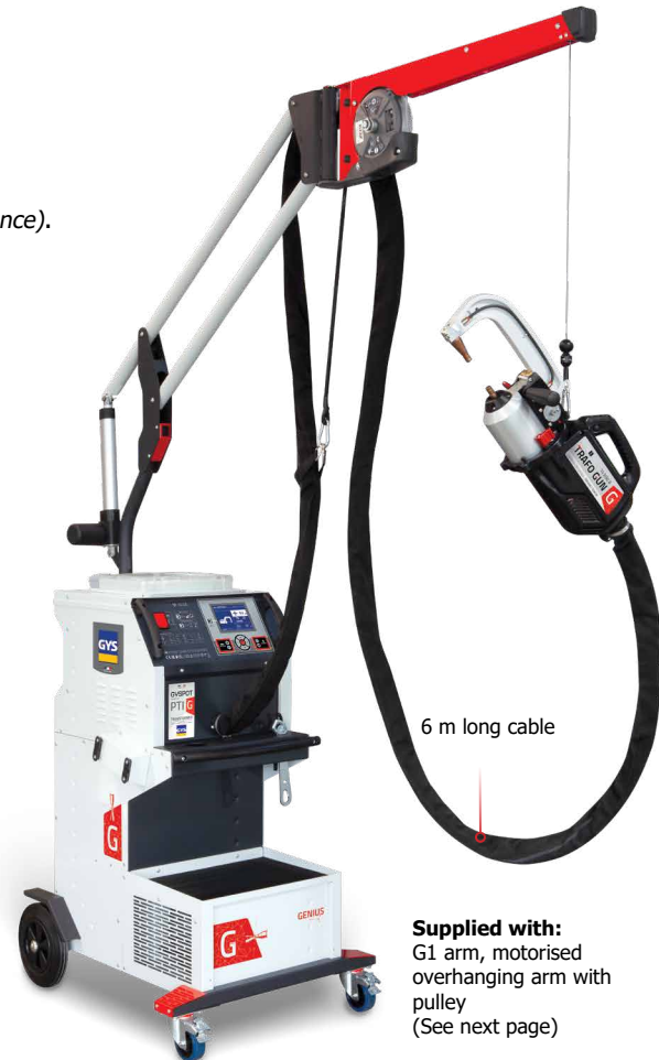
Supplied with: G1 arm, motorised overhanging arm with pulley (See next page)